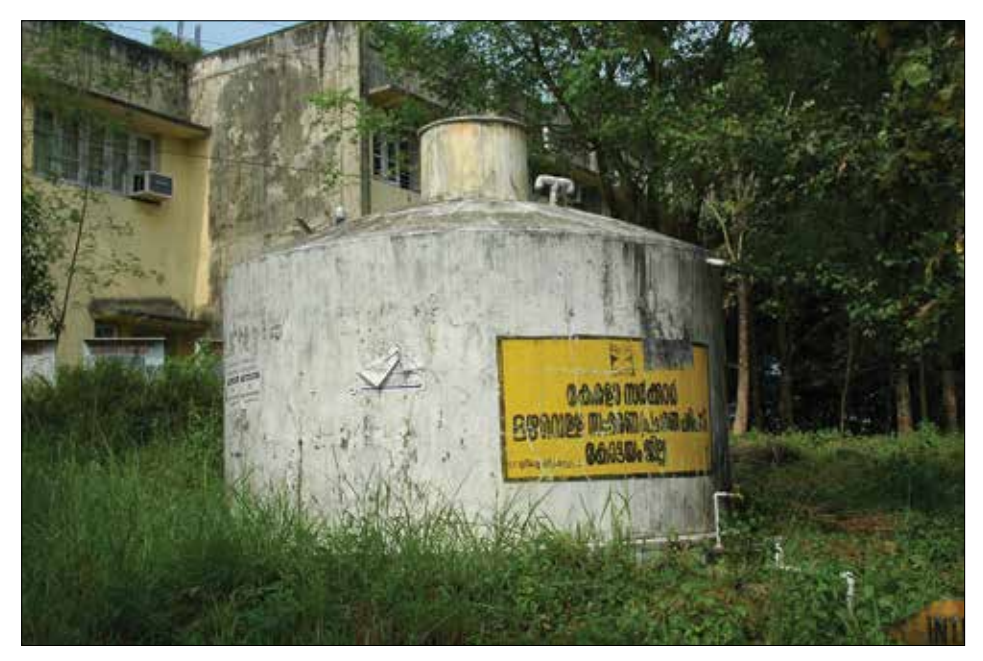
Rainwater-Harvesting Tank in Study Area

fecal contamination. In general the quality of rainwater is not treated for bacteriological quality and is assessed at the household level because of the presence of leaves and other materials such as mosquito larvae, insects, rodents, frogs, etc. The World Health Organization (WHO) proposed appropriate treatment techniques to use harvested rainwater as a safe drinking water source (WHO, 2006). Researchers revealed the value of solar disinfection (SODIS) as a low-cost, sustainable, and simple method of treating contaminated water in developing countries (Acra, Jurdy, Muallem, Karahagopian, & Raffoul, 1989; Acra, Raffoul, & Karahagopian, 1984; Sommer et al., 1997).